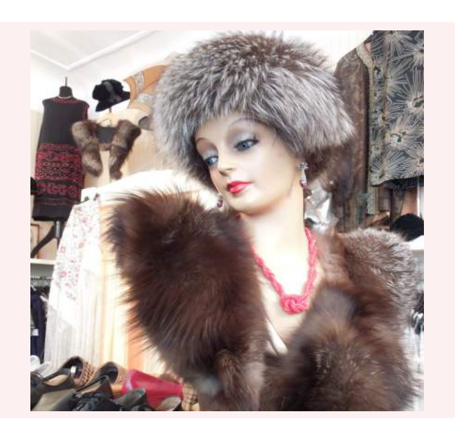
2. Vintage Fur in Berlin Tour Saturdays 10am-6pm // Full Day Tour

Berlin is known as the wild party capital of Europe. But there are a lot more wild things to discover when it comes to modern furniture, lamps and objects from the 20th century and earlier. With 50+ warehouses and boutiques, this fast-growing artsy capital of Germany offers a huge variety and one of the lowest price points in Europe, especially for mid-century and industrial furniture. A lot of these warehouses and boutiques are not easy to find, hidden in the backyard of Berlin's typical old buildings or outside the city borders. Our Where The Wild Things Are — Berlin Modern Furniture Tour will take you there. Shop in the former locations of a huge futuristic rock club, an old mill and buy where others don't.