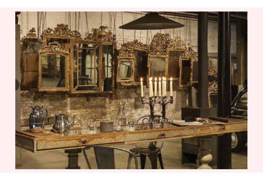
2. The Hague Antiques Tour Thursday - Saturday 10am-6pm // Full Day Tour

Our Netherlands antiques buying guide picks you up at your hotel and will lead you through the city on foot or tram — trust us, this is not a city you want to drive in! We'll visit an indoor antiques mall, a variety of by appointment—only vendors and some antique shops both on the beaten path as well as well off of it. Whether you're looking for well—priced smalls or pieces of furniture from the past, Amsterdam has a lot to offer. On tour, we'll visit everything from high—end, high—sheen sensational antique shops in the famous Jordaan Quarter to beautiful, budget—conscious bric—a—brac shops.